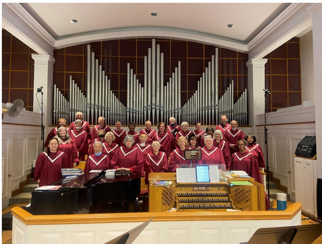
Chancel Choir in service.

Are you looking for a group to make music with? Come join us! Please contact Ying at music@fhcpresb.org if you are interested. Participants are encouraged to be up to date with their vaccinations.