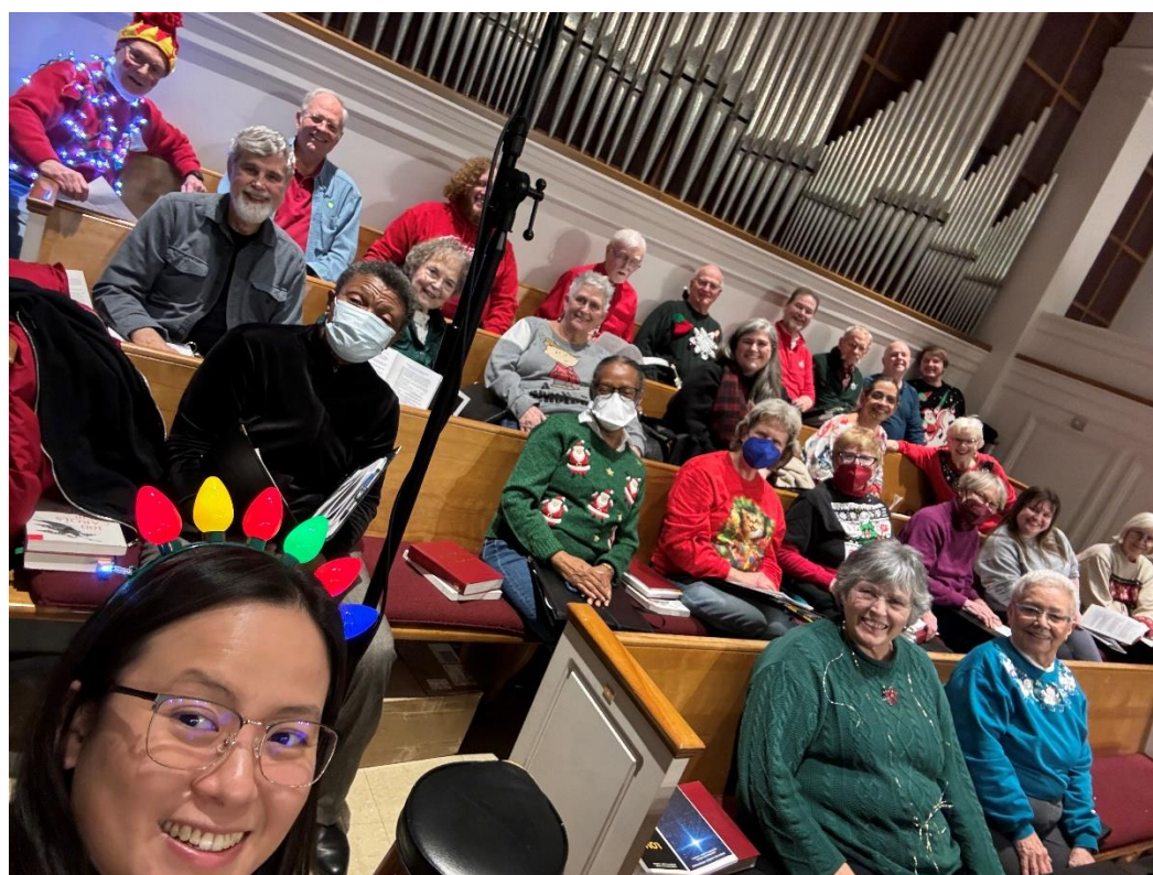
Chancel Choir at the Ugly Sweater Competition.