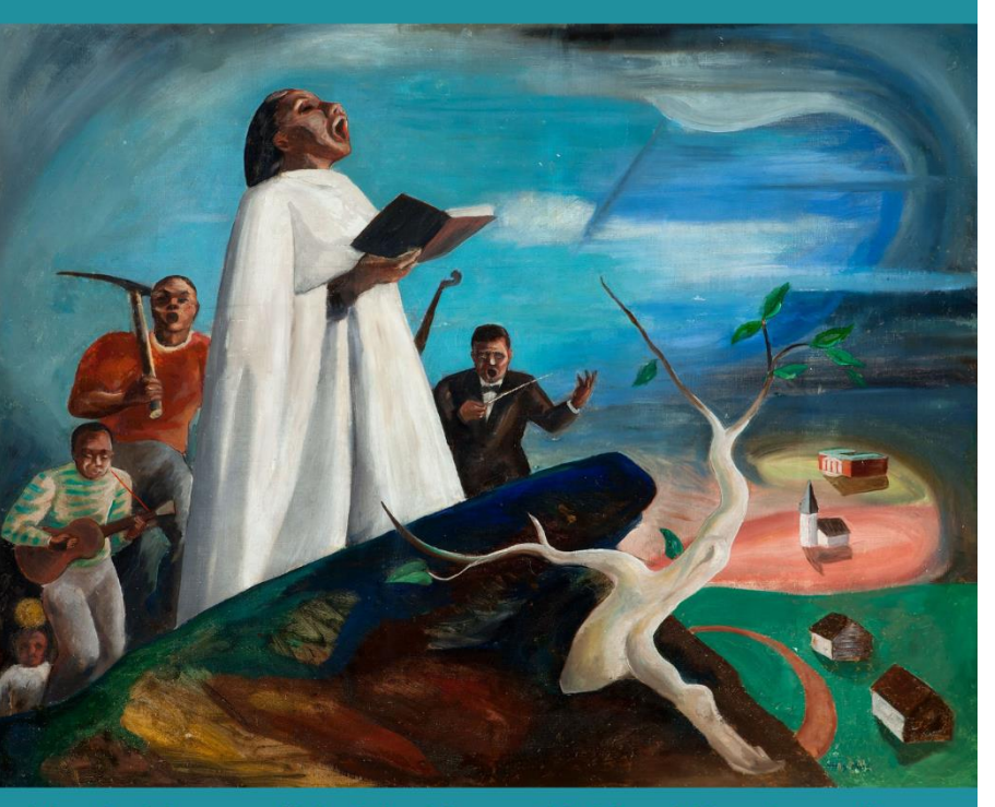
Vertis Hayes, "Untitled," ca. 1940s; Mixed media on canvas; 36 1/4 x 44 inches; LeMoyne-Owen College

You may also join worship online using this link: https://youtube.com/live/-EePrfAxvb8